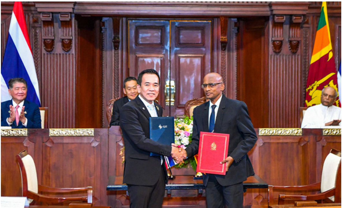
An MoU was signed between Gem and Jewellery Research and Training Institute (GJRTI) of Sri Lanka and Gem and Jewellery Institute of Thailand (GIT) on Feb. 03, 2024.