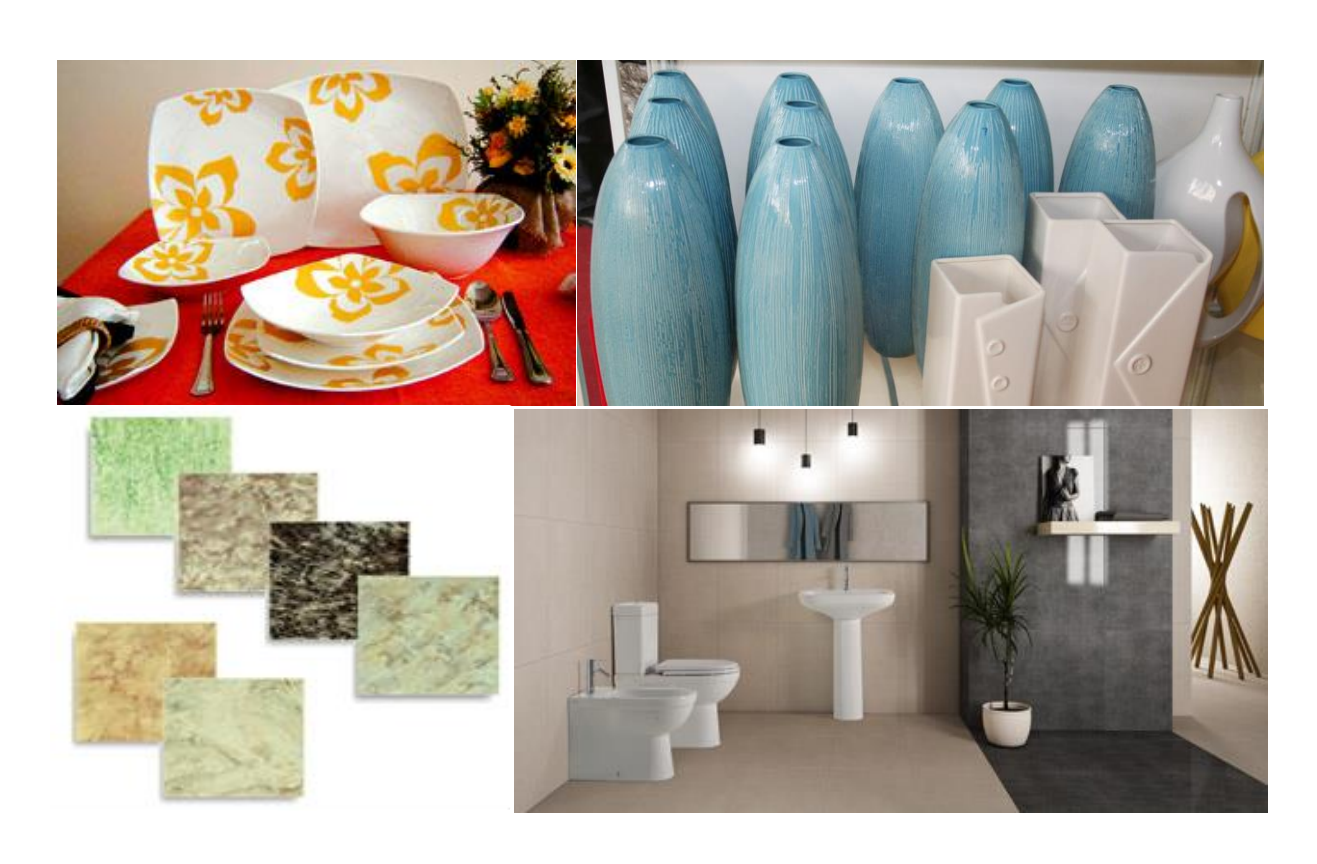
Sri Lankan Ceramic Sector