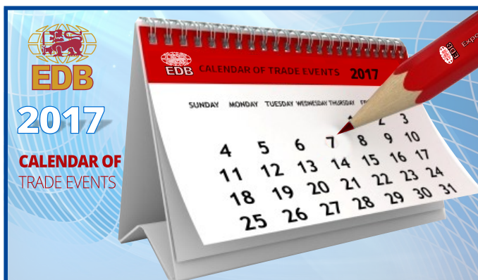
EDB's Calendar Trade Events - 2017 07