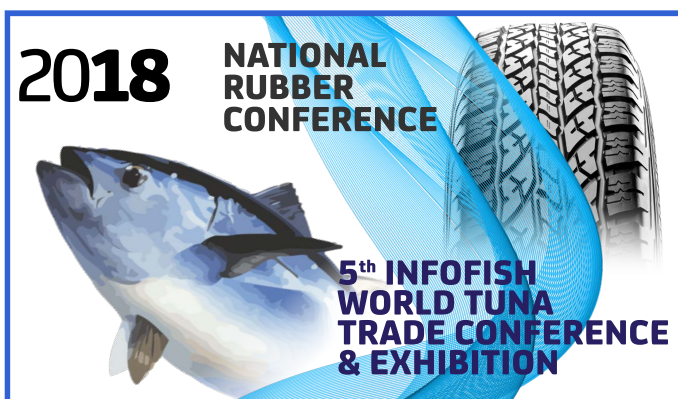
2018 Trade Conference, Fairs & Exhibitions 13~16