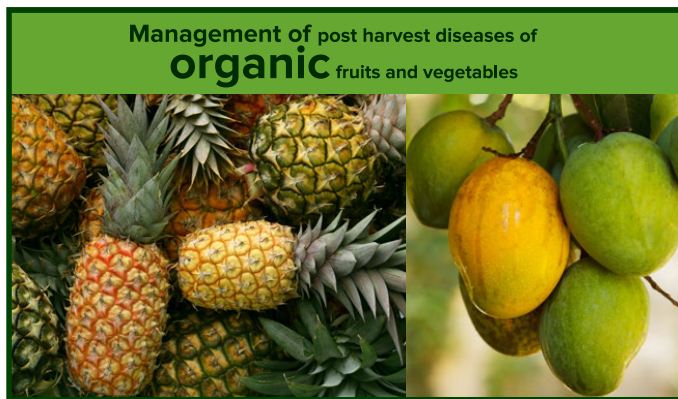
Article - Management of Organic Fruits 10~12