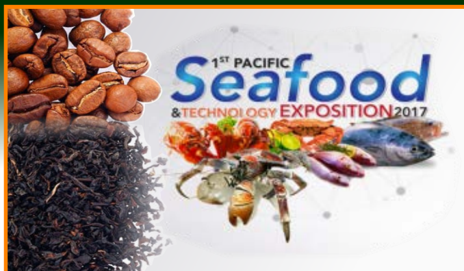
International Trade Conference (Overseas) 02~03