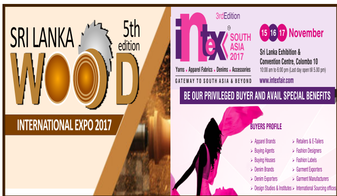
International Trade Exhibitions (Local) 08~09