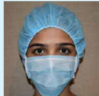
Head/hood Covers And Caps