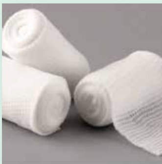
Absorbent Cotton Gauze