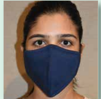
Reusable Fabric Facemask