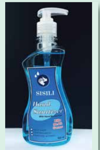
Hand Sanitizer (Ethanol Or Isopropanol)