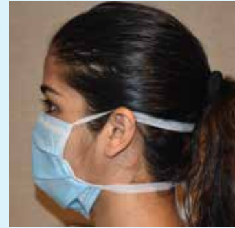
03 Ply, Disposable Surgical Facemasks