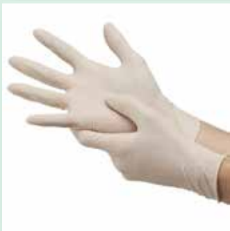
Medical Disposable Sterile Surgical Gloves