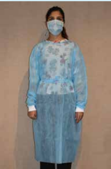
Surgical & Isolation Gowns