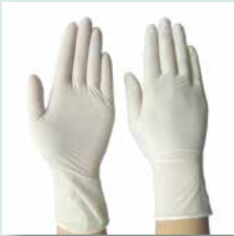
Medical Disposable Latex Examination Gloves

As of May 2020, our product portfolio of medical disposables and personal protective equipment (PPE) is as follows: