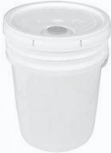
20L (5 gal)