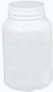
4 L (1 gal)