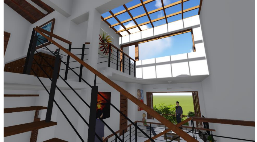
Luxury House in Beddagana, Pitakotte