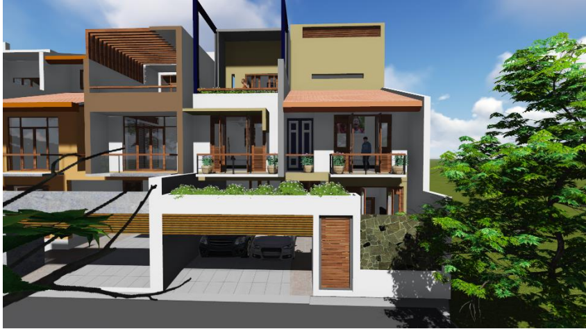
Luxury House in Pothuarawa, Malabe