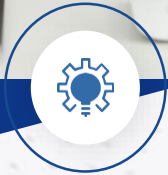
ERP Solutions for the Future