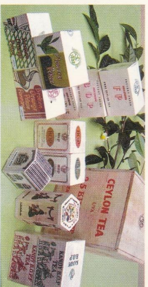
Tea in Wooden Boxes