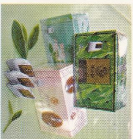
Tea Bags Range of tea bags and flavoured tea bags packed in paper boxes