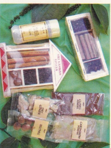
Ceylon Spices Black Pepper, Cinnamon, Cloves Nutmeg from our plantation.

Tea containers and tea wares in pure silver and brass handmade by the traditional craftsmen of Sri Lanka.