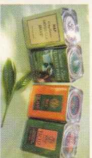
Tea in Tins 100g tea packed in attractive tins