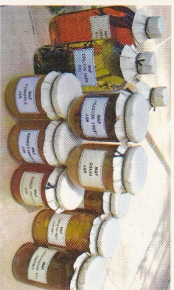
Jams, Chutneys, flavoured oils Range of home-made tropical jams