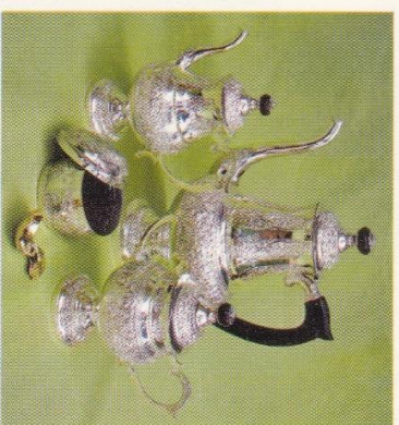
Tea in pure silver containers

Tea containers and tea wares in pure silver and brass handmade by the traditional craftsmen of Sri Lanka.