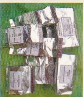
Tea in bulk Tea packed in alu-foils