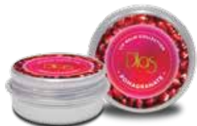
Pomegranate Rs. 700

D'las Lip Balms are enriched with the goodness of natural jojoba oil, moisturizing Shea butter and olive oil. Keeps your lips moisturized and nourished for longer. A promise of nature to keep your lips healthy and beautiful.