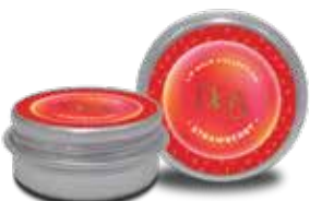
Strawberry Rs. 700