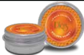
Golden Honey Rs. 700