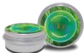
Peppermint Rs. 700