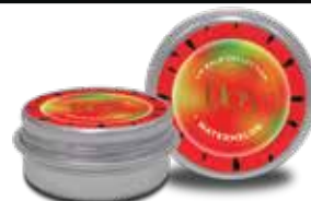
Water Melon Rs. 700