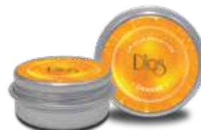
Orange Rs. 700