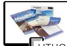
LITHO/ BOARD PRODUCTS