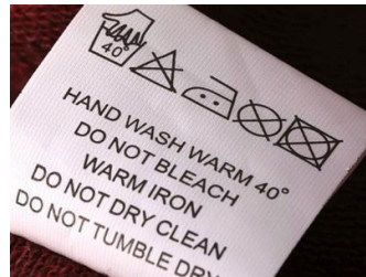
PRINTED CARE LABELS