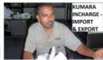
KUMARA INCHARGE - IMPORT & EXPORT