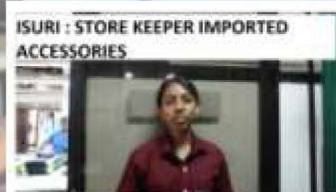
ISURI : STORE KEEPER IMPORTED ACCESSORIES