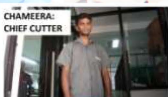
CHAMEERA: CHIEF CUTTER