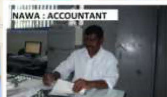
NAWA : ACCOUNTANT