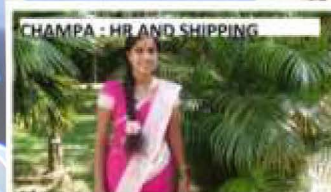
CHAMPA : HR AND SHIPPING