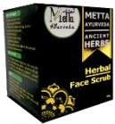
HERBAL FACE SCRUB | Beauty Product.