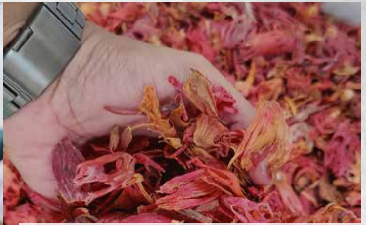
Sustainably & ethically sourced