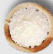
MEDIUM & FINE