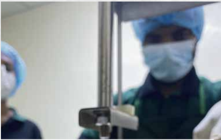
Highly skilled staff