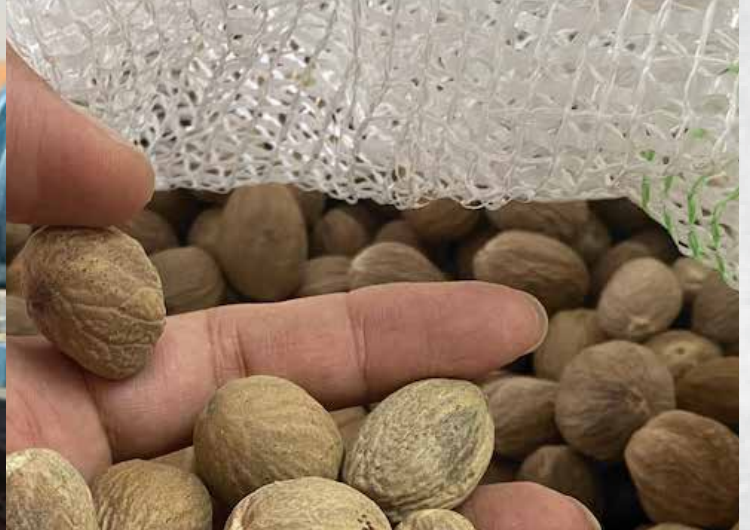
Organic & fairtrade certified