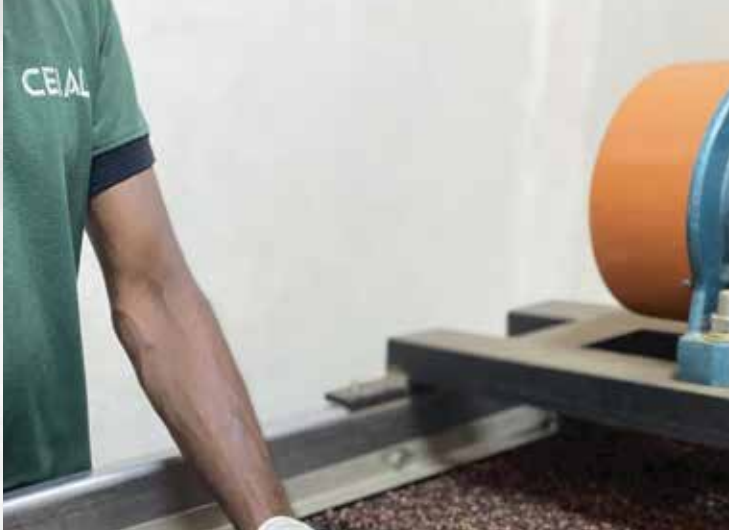
International standard facilities