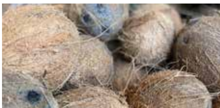
OTHER COCONUT LIQUIDS