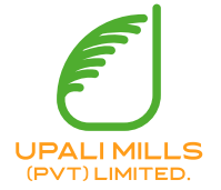
Upstream Facility Puttalam District, Sri Lanka