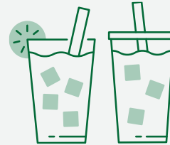
ICED TEA AND COFFEE