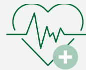
HEALTH AND WELLBEING