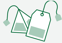
HOT TEA AND INFUSIONS