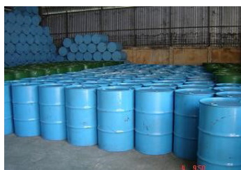
FIGURE 2: BULK PACKAGING IN METAL DRUMS AND PALLETS WITH BOXES OF A PRODUCT IN CONSUMER PACKAGING

The European market has some of the highest requirements for food products. Minimum requirements such as a HACCP-based food safety management system, compliance with strict limits for contaminants and documentary requirements already prevent many small producers from other countries to export to Europe.