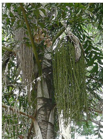
FIGURE 1: PHOTO OF CARYOTA URENS