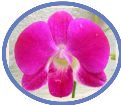
Dendrobium Princess Michiko