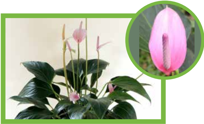
Royal Highness Princess Maha Chakri Sirindhorn