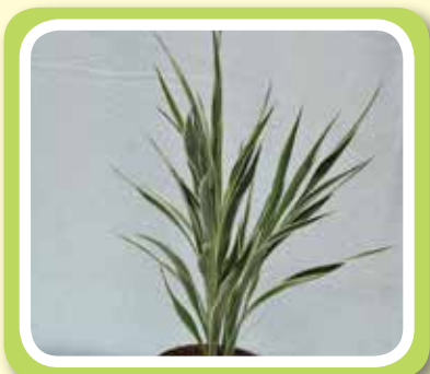
Dracaena sanderiana “cellus”