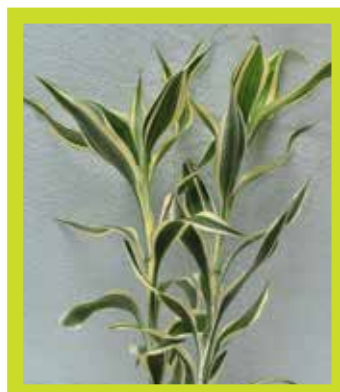
Dracaena sanderiana "white"