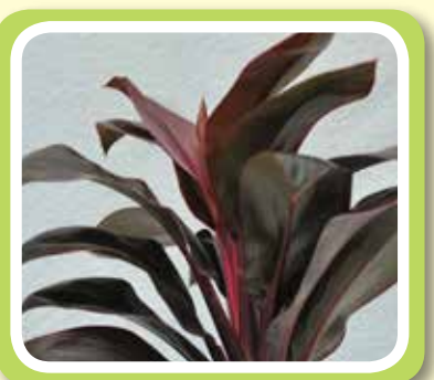
Dracaena “purple compacta”