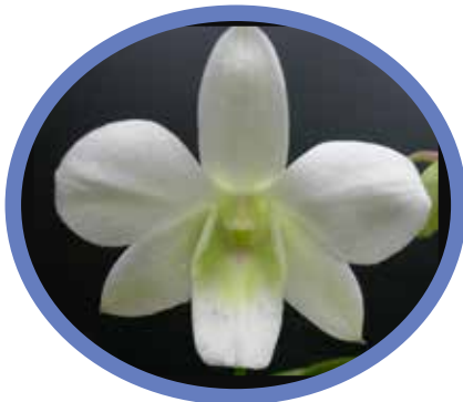
Dendrobium Royal White