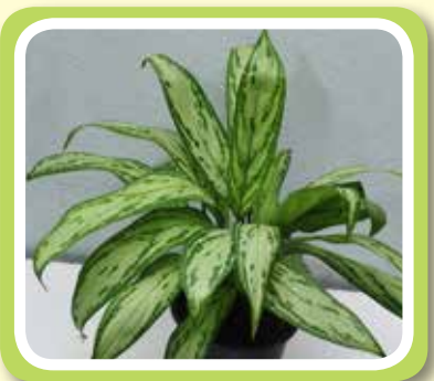
Aglaonema "silver queen"