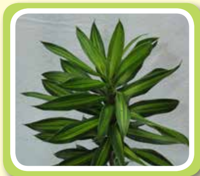
Pleomele reflexa "Song of Jamaica"