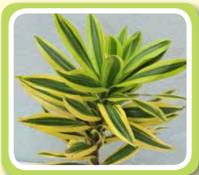
Pleomele reflexa "Song of India"