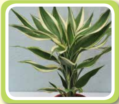
Dracaena sanderiana “white”

Sri Lanka produces a wide range of young rooted cuttings of “non flowering” ornamental foliage plants. Unrooted cuttings and canes (semi finished plant material) are exported to be used as mother plants to grow indoor and outdoor in overseas nurseries. The assortment includes both local and imported varieties.