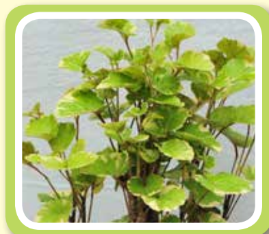
Polyscias balfouriana - bush