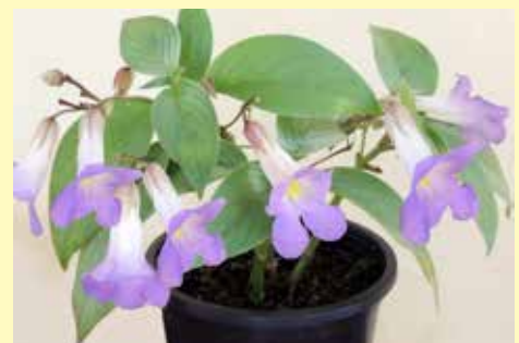
"Chirita Royal Queen"