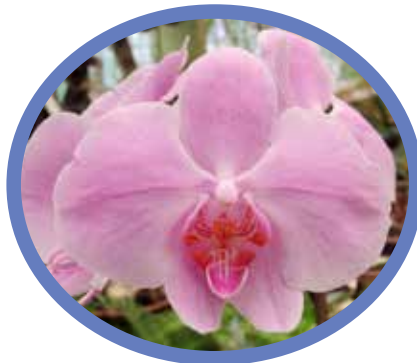
Phalaenopsis Chandrika Bandaranaike Kumaratunge