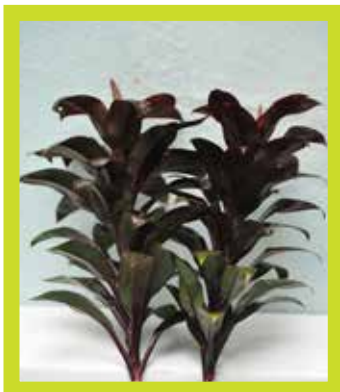
Dracaena purple compacta

Tropical cut greenery is used worldwide for decorative purposes . Exporters are able to supply a rich variety of temperate and tropical types of cut greenery and are therefore fully geared to meet export orders throughout the year regardless of seasonality.