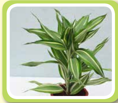
Dracaena sanderiana “victory”