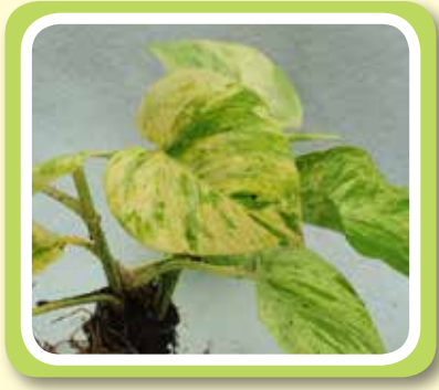
Scindapsus "marble queen"