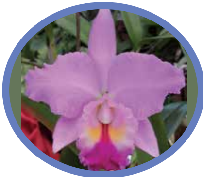
Cattleya Her Imperial Highness Princess Suguko of Takamado