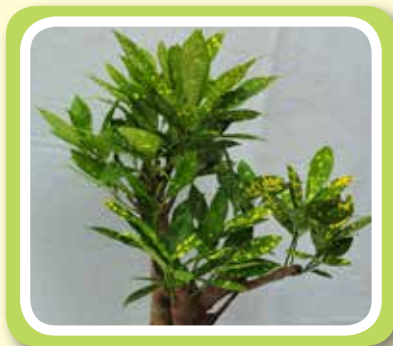
Codiaeum aucubifolia -bush