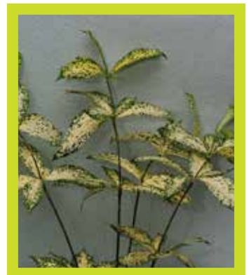
Dracaena godseffiana (florida beauty)