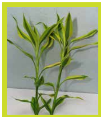
Dracaena sanderiana "gold"