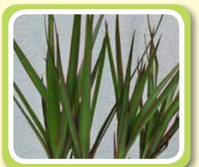
Dracaena marginata “green”