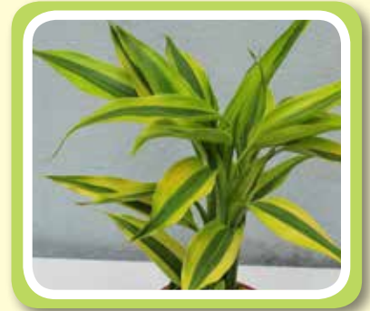
Dracaena sanderiana “gold”