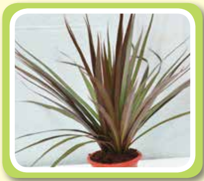
Dracaena marginata "magenta"