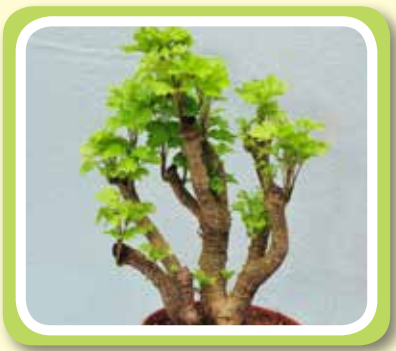
Polyscias "crispum" - bush