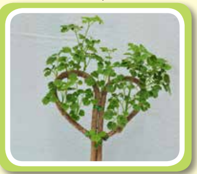
Polyscias "crispum" "-heart bush