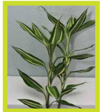
Dracaena sanderiana "victory"