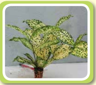
Dracaena godseffiana (florida beauty)