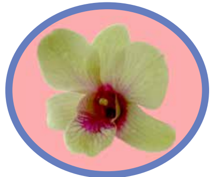
Dendrobium Royal Splash