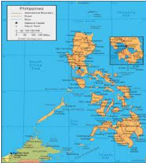
The Philippines – Map