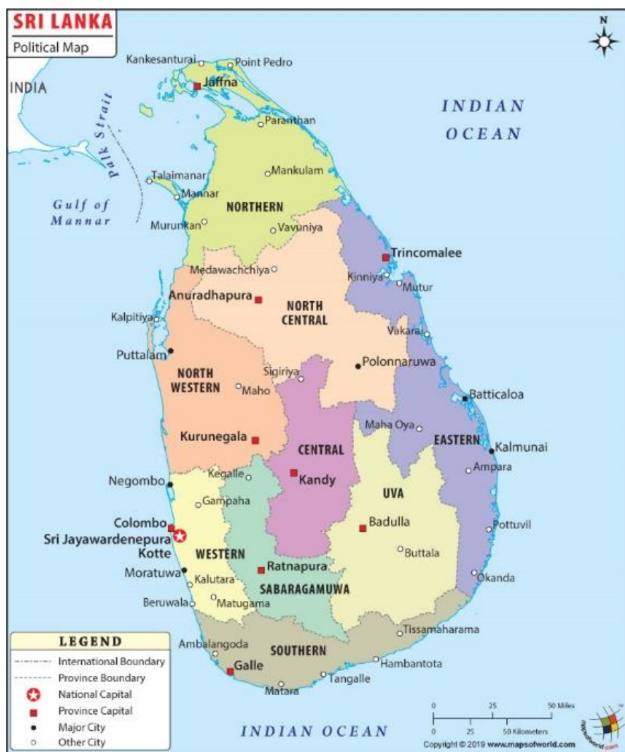
Map of Sri Lanka with its 9 provinces and major cities

Capital City: Sri Jayewardenepura Kotte (legislative capital) Colombo (executive and judicial capital)