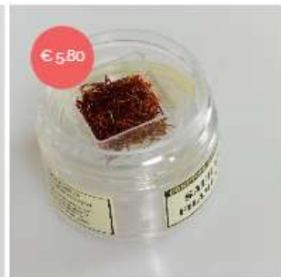
Saffron filaments - Category ... In stock