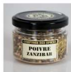
Poivre Zanzibar 4.30 €