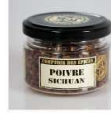
Sichuan pepper 4.30 €