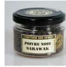
Black pepper Sarawak