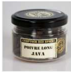
Long pepper from Java 4.90 €