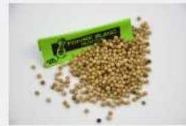
White pepper grains