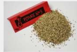
Black pepper n° 3