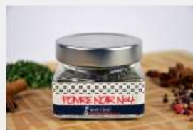
Black pepper n° 4