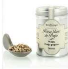
Penja pepper white 70g 8.85 €