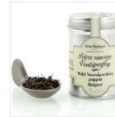
Voatsiperifery pepper 60g 9.70 €