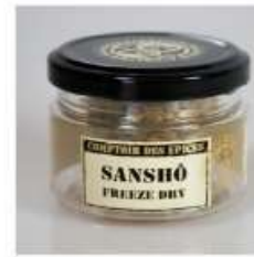
Sanshō Freeze Dry 5.50 €