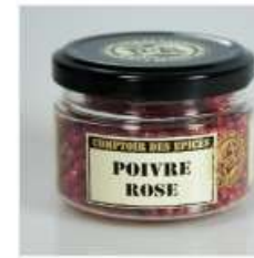
Pink pepper 4.30 €