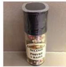
Pepper mixture 5 berries - Mill 5.10 €