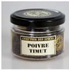
Timut pepper 5.80 €