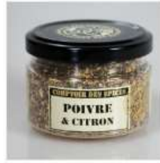
Lemon pepper 4.30 €