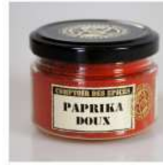
Sweet paprika 3.80 €