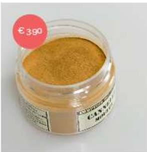
Ground Cinnamon Cinnamon In stock