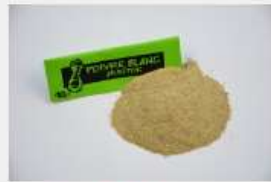
Ground white pepper