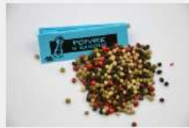
Pepper 4 seasons grains