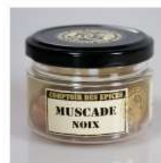
Muscade Noix 3.80 €