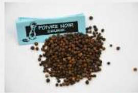
Black pepper grains