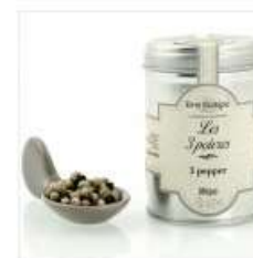
3 Poivres de Penja 80g 9.20 €