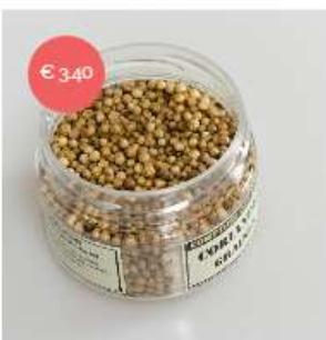
Coriander seeds In stock