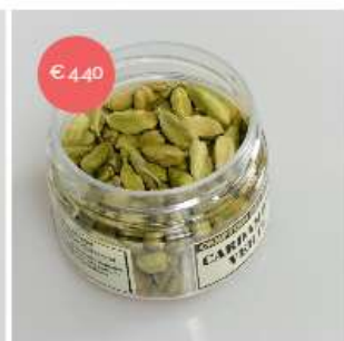
Green Cardamom Bold Green ... In stock

Anim-Project SNC Rue de l'Usine, 7, 4802 Heusy BELGIUM Tel: +32 87 84 05 34 Email: sons@makersandsons.com