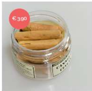
Cinnamon Ceylon sticks 4 ... In stock