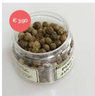
Allspice ... In stock