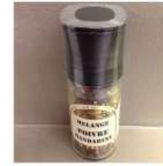
Mandarin Pepper Blend - Mill