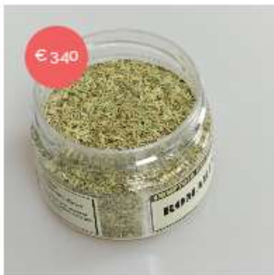
Rosemary crushed leaves In stock