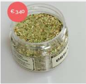
Oregano leaves In stock