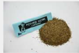
Ground black pepper