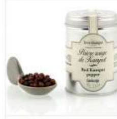
Kampot red pepper 60g 9.70 €