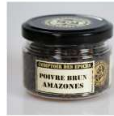
Amazons Brown Pepper 4.90 €