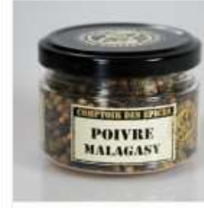
Malagasy pepper (Madagascar) 4.30 €