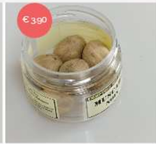
Nutmeg whole nuts In stock