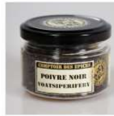
Voatsiperifery pepper 5.80 €