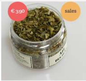
Wild Bear Garlic ... In stock