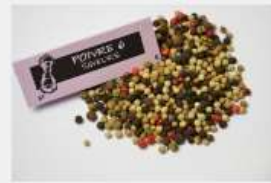
Pepper 6 flavors