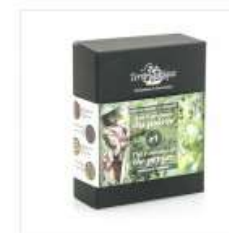
Coffret Découvrir les 4 couleurs du poivre - Terre exotique 29.90 €