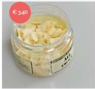
Minced garlic (petals) In stock