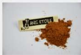
Ground Star Anise