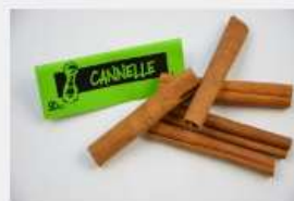
Hard cinnamon sticks