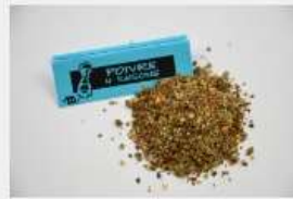
Crushed 4 season pepper