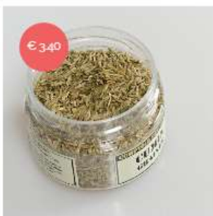
Cumin seeds In stock