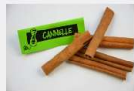
Cinnamon Ceylon sticks