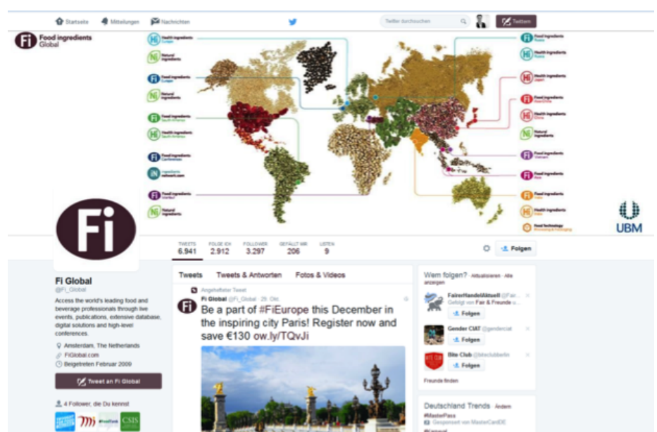
FIGURE 5: EXAMPLE OF THE FOOD INGREDIENTS TRADE FAIR TWITTER PROFILE

If possible, the task of trade fair communication should be assigned to a selected person within your company who should then closely cooperate with the trade fair manager.