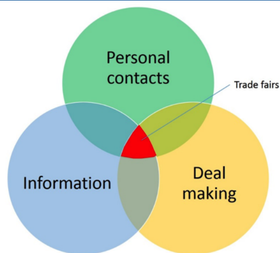
FIGURE 1: BENEFITS OF TRADE FAIRS.

Recent surveys have shown that 86% of all business leaders consider trade fairs as one of the most important tools in the sourcing and procurement process. From a business leader's point of view, trade fairs mainly provide an opportunity to collect information (72%), facilitate the exchange between business partners (71%) and source products and materials (43%). The unique strength of trade fairs compared to any other form of business-making lies in the combination of three main elements: personal contacts, information and deal making. 2 There is no comparable tool that unites these three elementary business factors in one event.